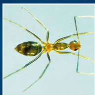
Yellow Crazy Ant