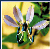
Fringed Spider Plant