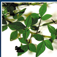
Fringed Spider Plant