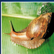
Giant African Snail